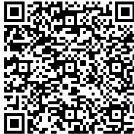
Example #2 (via Wisconsin HOSA)