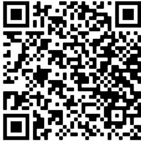
Example #1